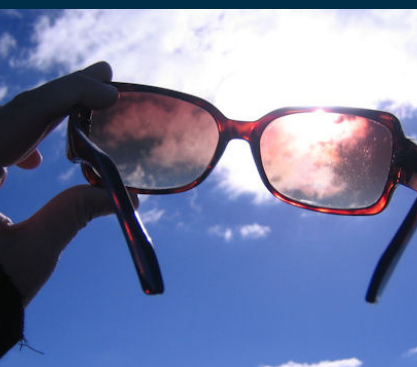
UV protection glasses