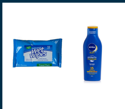
Wet-wipes / Sunscreen