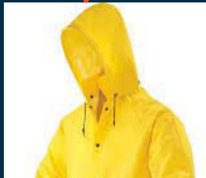
Poncho or Raincoat